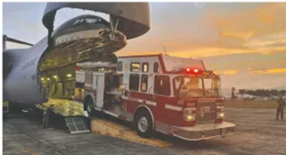
Ferdinand the fire truck is unloaded from a U.S. Air Force Lockheed C-5 Galaxy at the La Aurora International Airport in Guatemala City.

FRIDAY, APRIL 25, 2025 CALGARY HERALD A3